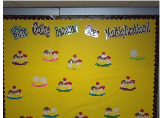
The Fourth Grade Banana Split Multiplication Board!

The fourth grade celebrated their banana split party on Friday, November 13th. Thanks to all the families who helped bring ingredients. It was a delicious way to learn our multiplication facts!