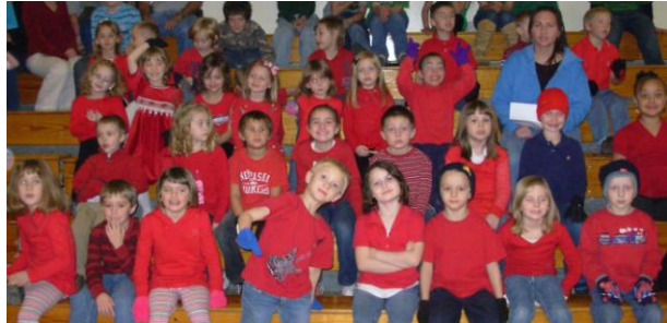
The Kindergarten classes were ready and raring to go before the concert on Tuesday. They performed a song called "Snow Pants."