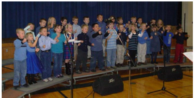
The First grade did a great job during their song, "Over the River and Through the Woods."