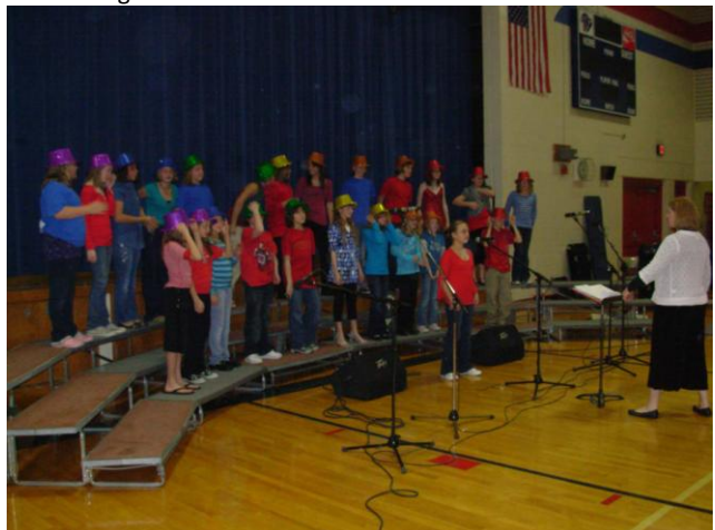
The Bennet Singers, which consists of 5 th and 6 th grade students, sang two songs at the program, "Winter Walk" and "North Pole North Pole."