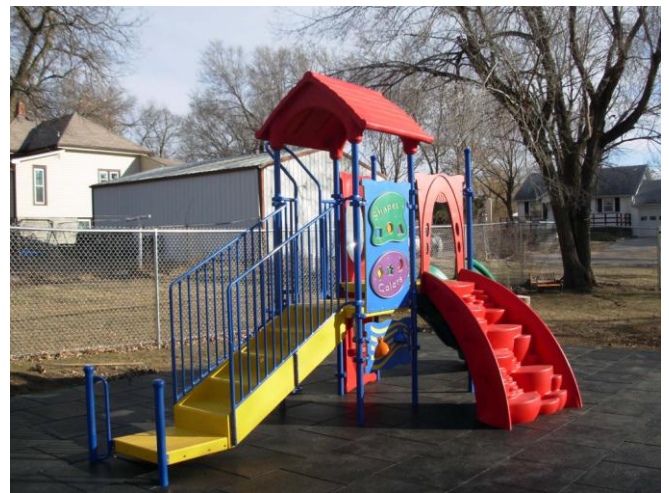
Yes, it was a snowless landscape last year at this time! Take a look below at the same playground!

In looking at last year's newsletter for this week, I noticed a picture of the new preschool playground equipment that had been installed. Take a look: