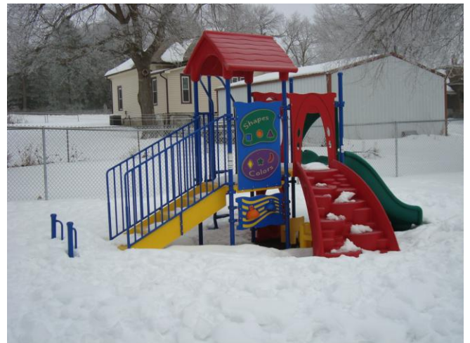
Different scene altogether, isn't it. It is a snowy landscape out there, as you can see below.