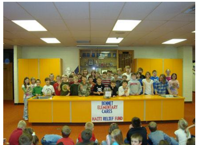
Grades 4 – 6 Comprehension Award winners are shown above.