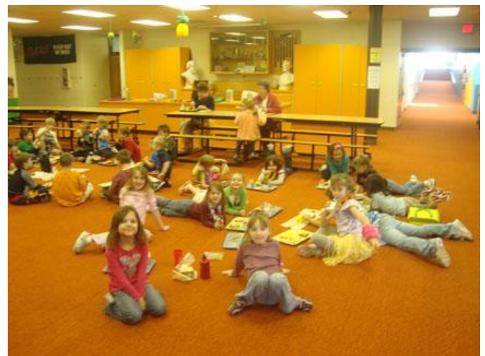
The kindergarten class enjoyed eating picnic style on the floor!