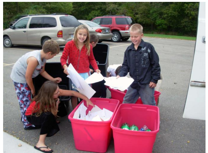
Students from the 4 th grade sort out recyclable materials from school to be placed in the white van. When the van is full, it is taken to the Bennet Recycle Center for transfer to their recycle bins.

In addition to all of the classrooms, our school kitchen has jumped on board and is recycling all of the tin cans, cardboard, glass and plastic materials that they receive, which is considerable. Our school dumpsters, which last year, were constantly overflowing with "trash" that was headed to the landfill, are now hardly ever full. What a difference this has made. The students and staff have readily adapted their habits and are now "recycle conscious." Thanks to the efforts of everyone, Bennet Elementary is taking big strides towards being a "Green School!"