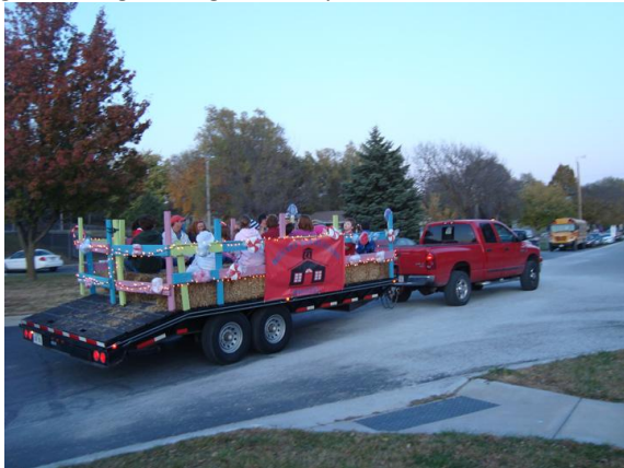
The hayrack ride was very popular at the Fall Family Festival on Friday, October 28 th

included face painting, bean bag toss, balloon art, and pumpkin decorating. The hayrack ride was a big hit, as well as the tug of war and sack races on the lawn south of the school. A great round of thanks should go to our Bennet Elementary Boosters for once again hosting such a great family event!