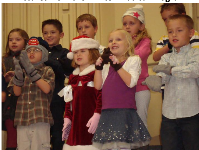
Members of the Kindergarten Class performing "Mittens and Gloves."