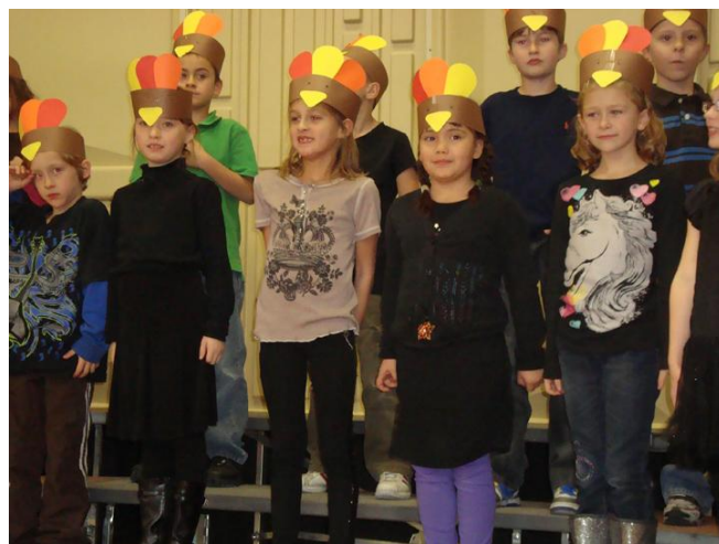
The second grade sang the "Turkey Woogie!"