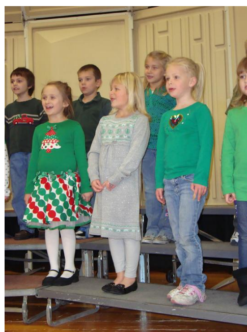
The First Grade sang "Under the Tree."