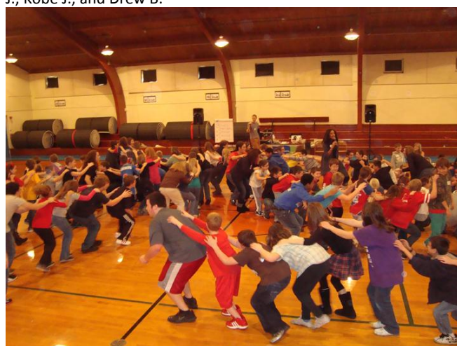
One of the large group exercises that students did with the help of our peer leaders was the "Soul Train."