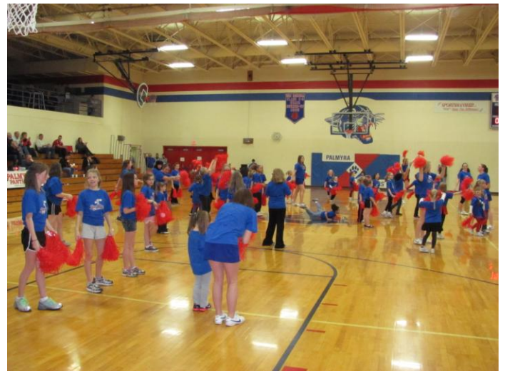
Bennet Elementary girls, along with help from the Palmyra Cheerleaders, performed a cheer for the audience during halftime of the Boys Basketball game last Friday.