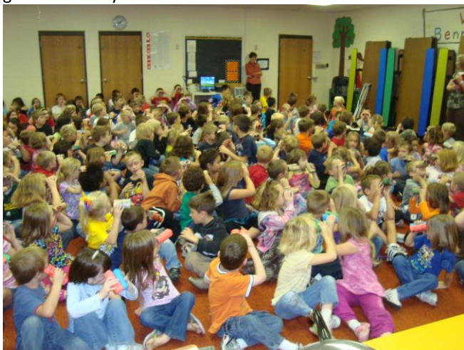
Bennet Elementary Students use their "Fire Hazard Goggles" to spot potential fire hazards in the cafeteria at the assembly on Wednesday.

Our thanks to all of the members of the Bennet Fire and Rescue Department for taking the time out of their day to come up to Bennet Elementary and provide such a great assembly.