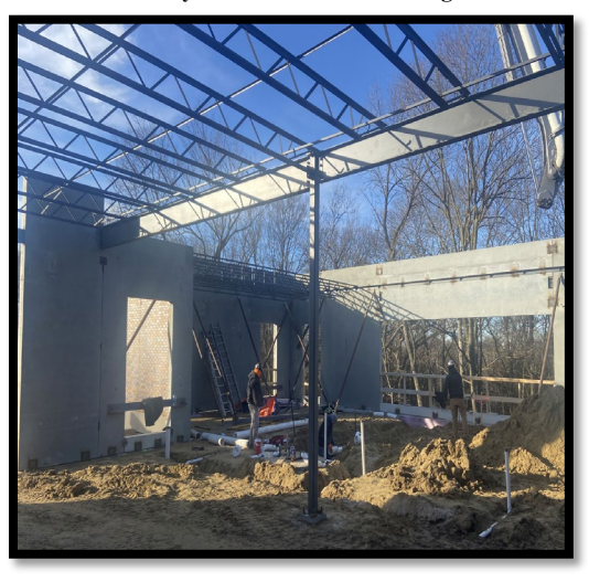
Bennet Elementary West side addition facing Southwest