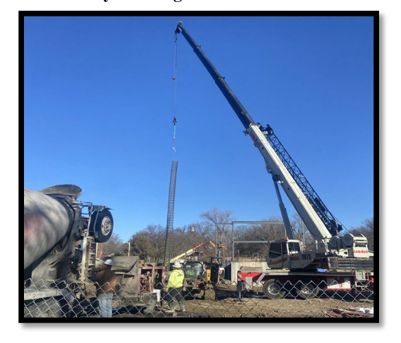
Palmyra facing north

Add additional classrooms on the northeast side of the building.