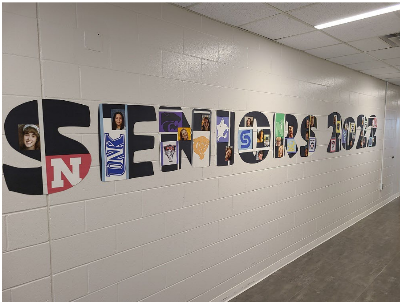
The Class of 2022 in pictures around their post-graduation destinations.