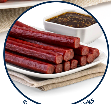
Sweet Teriyaki Snack Sticks