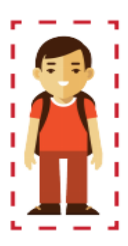
individual must ISOLATE